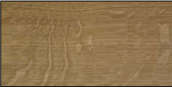
NORTHERN WHITE OAK

* Thickness available special order only.