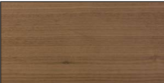
NORTHERN BLACK WALNUT

Midwest Hardwood's Rift & Quarter sawn White Oak also offers a higher degree of color consistency due to the sourcing of high quality Northern hardwood timber. Quarter sawn white oak remains the species artisans use for mission and arts and crafts style interiors. It is chosen because the medullary ray fleck, wavy grain, and because other aesthetic qualities are more pronounced in White Oak than other species. White oak is also a denser, more stable, and durable species.