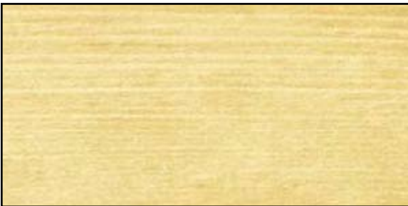
NORTHERN HARD MAPLE

The Rift & Quartered Northern Black Walnut offers buyers a volume source for a rare cut of hardwood in an already rare species. Rift & Quartered Walnut lumber is used for fine furniture, architectural woodwork, musical instruments, decorative panels, interior trim, and flooring and is more in demand today than ever before as it offers buyers a straight grained, dark, native North American hardwood