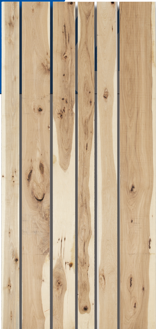
FRONT VIEW OF BOARDS