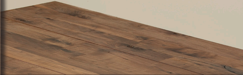
BACK VIEW OF BOARDS