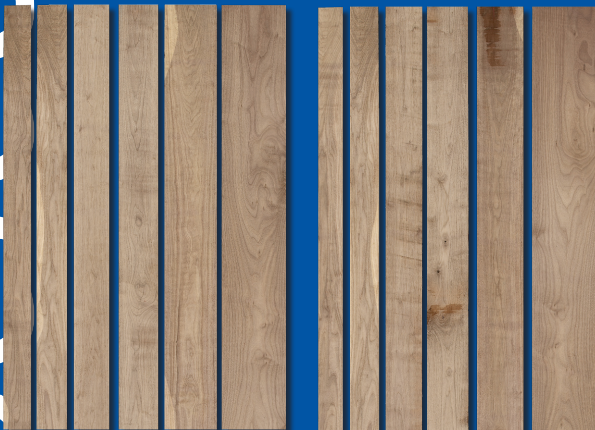
Front view of boards