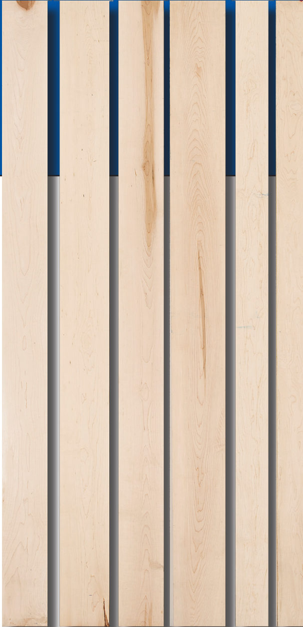
BACK VIEW OF BOARDS