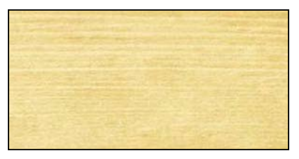
NORTHERN HARD MAPLE

The Rift & Quartered Northern Black Walnut offers buyers a volume source for a rare cut of hardwood in an already rare species. Rift & Quartered Walnut lumber is used for fine furniture, architectural woodwork, musical instruments, decorative panels, interior trim, and flooring and is more in demand today than ever before as it offers buyers a straight grained, dark, native North American hardwood