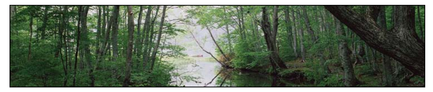
AVAILABLE SPECIES; NORTHERN HARD MAPLE, NORTHERN RED OAK, NORTHERN BLACK WALNUT, NORTHERN WHITE OAK AND NORTHERN CHERRY

Many of our customers are beginning to focus on FSC certified lumber sources. In order to create value through the FSC* chain we know you will need a valuable partner/supplier of FSC lumber and logs. Midwest Hardwood Corporation was one of the first North American hardwood lumber manufacturers to gain FSC certification. We were certified in 1995 and today hold multi-site certification covering our timberlands, sawmills, drying facilities and distribution yards. We can supply you large quantities of FSC North American Northern Red Oak, Hard Maple, Soft Maple, Ash, Aspen, Birch, Northern Black Walnut, White Oak, and Basswood in all grades. Please forward any FSC requirements you might have.