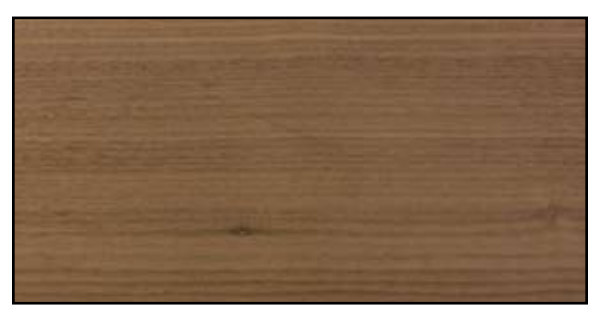
NORTHERN BLACK WALNUT

Midwest Hardwood's Rift & Quarter sawn White Oak also offers a higher degree of color consistency due to the sourcing of high quality Northern hardwood timber. Quarter sawn white oak remains the species artisans use for mission and arts and crafts style interiors. It is chosen because the medullary ray fleck, wavy grain, and because other aesthetic qualities are more pronounced in White Oak than other species. White oak is also a denser, more stable, and durable species.