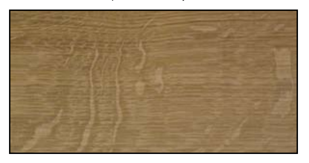
NORTHERN WHITE OAK

* Thickness available special order only.